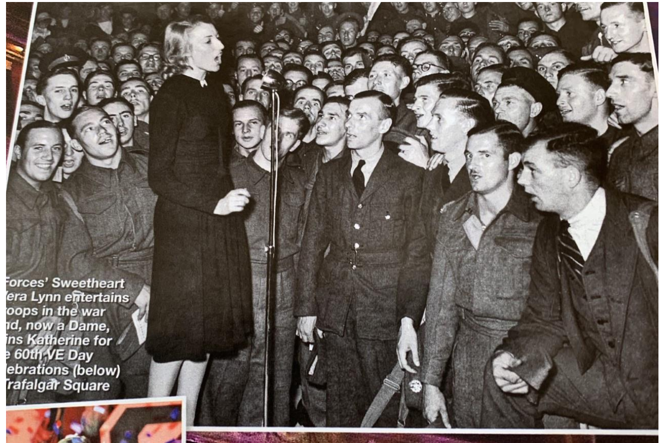
Forces' Sweetheart Vera Lynn entertains troops in the war and, now a Dame, wins Katherine for the 60th VE Day celebrations (below) Trafalgar Square

There is another song to do with the war and it is called You'll never walk alone . I have learned to sing it in sign language.